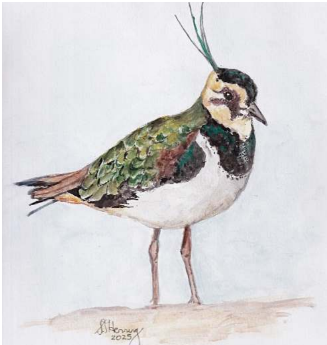
Lapwing (del. S.F. Henning)