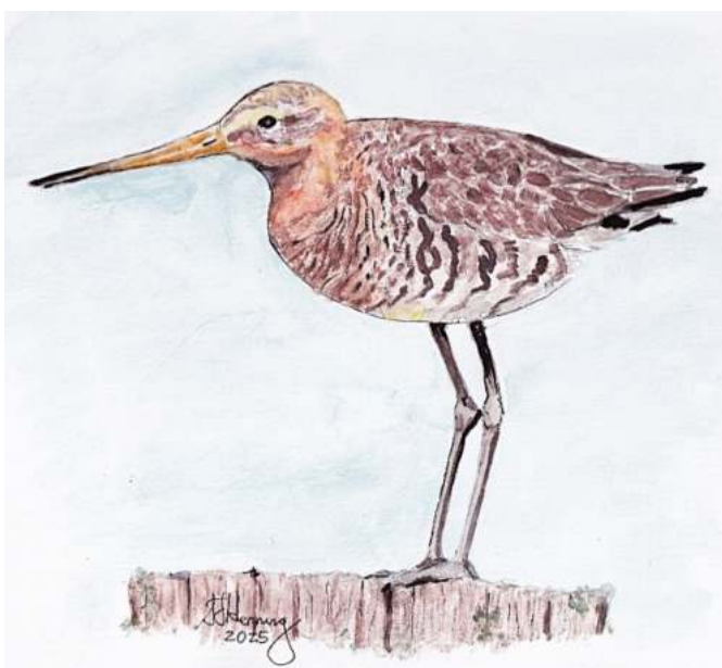
Black-tailed godwit

The most recent recorded sighting in Wiltshire was on the 3rd of January 2025 at the Cotswold Water Park.