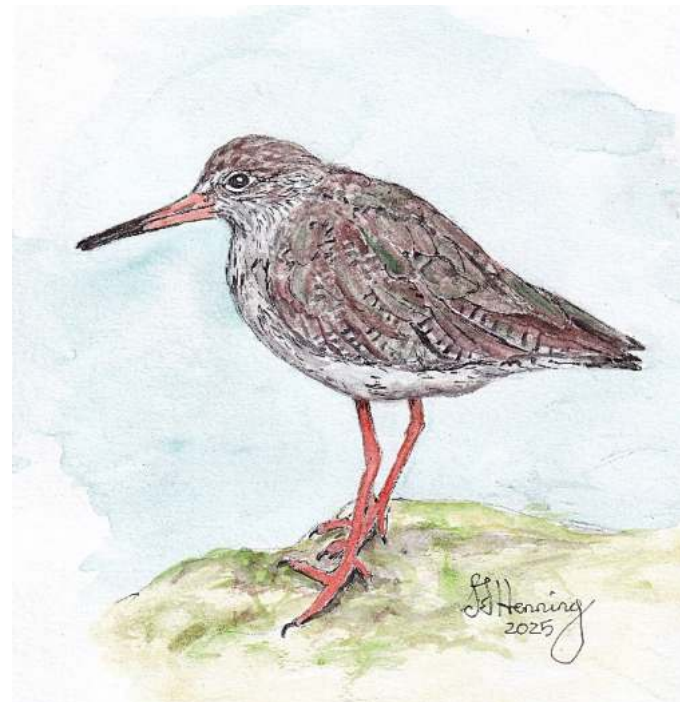
Redshank (del. S.F. Henning)

A typical wader but easily identified by its bright red legs and base of bill. It is often seen standing on top of posts guarding its territory during the breeding season. It uses its long bill to probe in the mud for worms, molluscs and crustaceans.