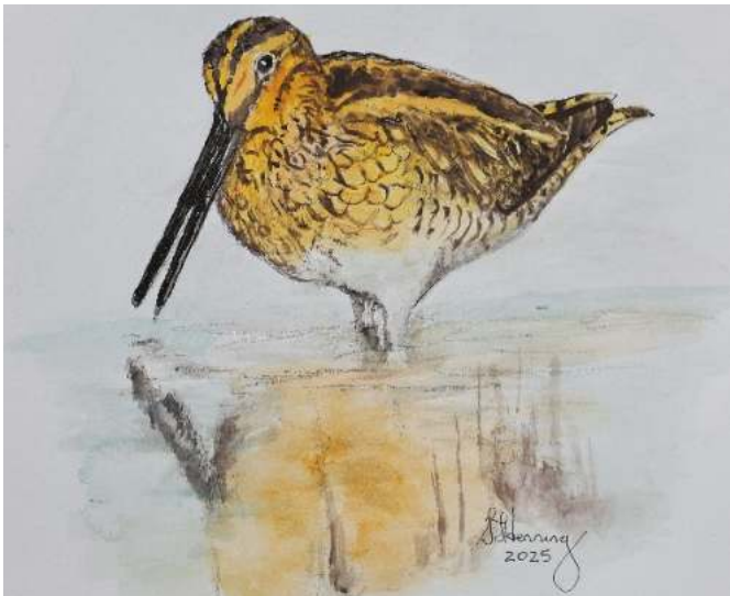
Common snipe foraging for food

It was recently recorded on the 25th of January 2025 at Cricklade, Wiltshire.