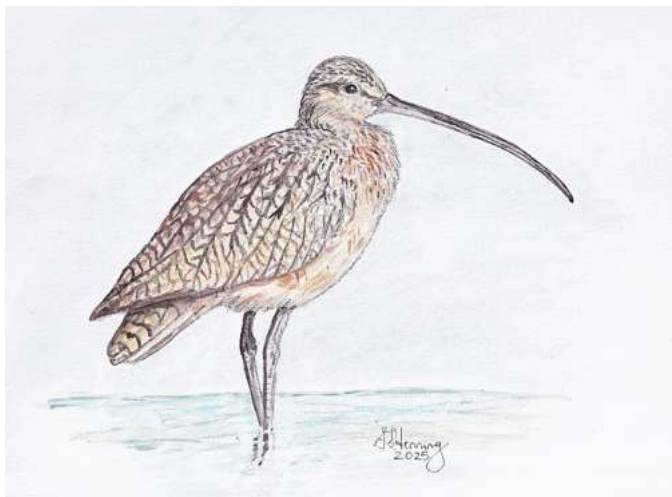
Curlew

Wiltshire, notably on Salisbury Plain; the open wet grassland needed by this species has meant that they have suffered at the hands of intensive agriculture. It has been reported that numbers have declined by 46% since 1994.