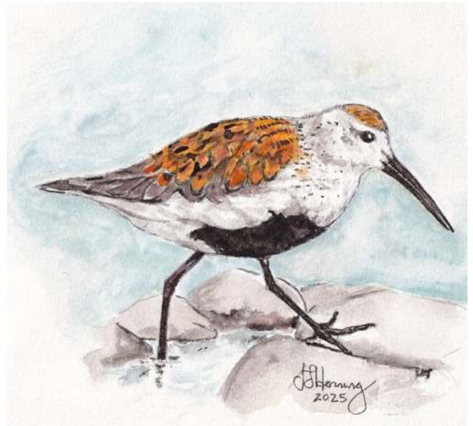
Dunlin (del. S.F. Henning)

Dunlins nest in boggy uplands in northern parts of the UK, heading to West Africa for the winter. Birds nesting in Iceland and Greenland also stop off here to refuel on their route south. Other dunlins spend the winter in the UK, arriving from breeding grounds in Scandinavia and Russia.