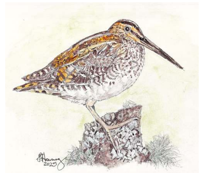
Woodcock (del. S.F. Henning)

In spring and summer, male woodcocks perform a display flight known as roding. At dusk, and just before dawn, they take to the air and patrol over large areas of their forest and heathland homes, calling in a series of grunts and squeaks, competing with other males to attract females.