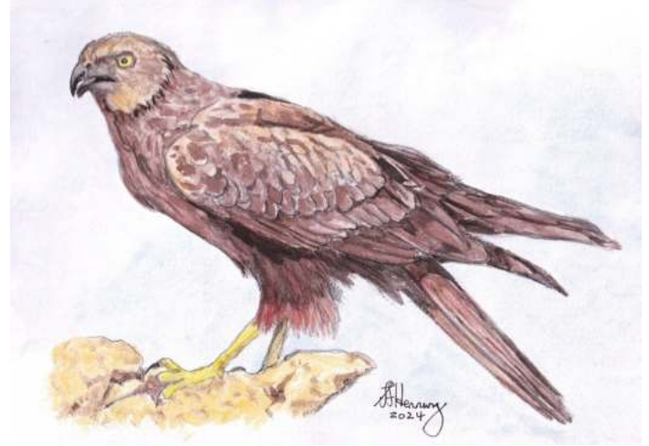
The Marsh Harrier is bulkier and broader winged than the Hen Harrier

broader winged than the Hen Harrier. The best place to observe one around here is Langford Lakes as the habitat is perfect for them.