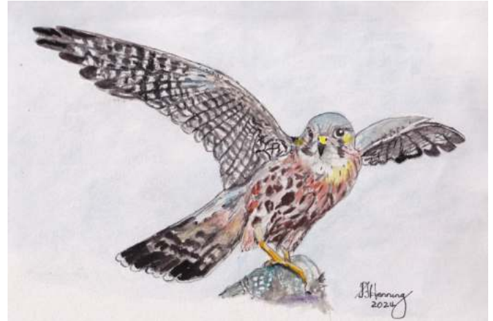
Male Merlin on its prey - a dead pigeon (del S.F. Henning)

twists and turns. It regularly perches openly on posts or rocks and will take off and land on vegetation or the ground.