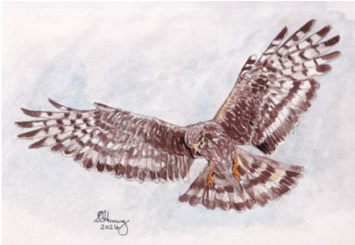
The female Hen Harrier is brown above with a white rump and streaked with brown and buff below. (del S.F. Henning)

widespread and can be found as far south as the south coast of England. It tends to keep to the coastal areas of England. The Hen Harrier breeds in upland heather moors but will also nest in young conifer plantations. However, in winter it visits lowland farms, fens, southern heaths, and coastal marshes. When hunting it flies low over the ground, with wings forming a shallow V when gliding. It usually feeds on small birds and mammals but may also take larger prey such as rabbits.