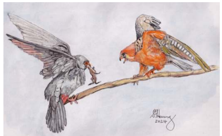
Sexual dimorphism in the Red-footed Falcon is more marked than in any other British falcon – male (left), female (right) (del S.F. Henning)

It breeds, often colonially, in Eastern Europe and