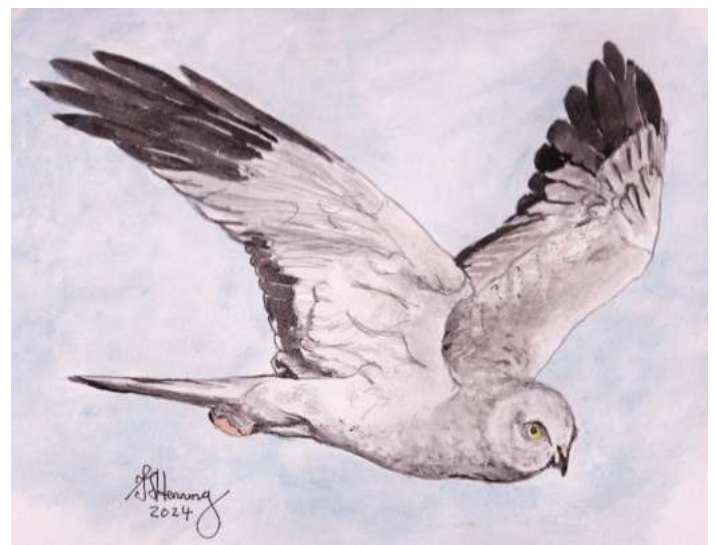
The male Hen Harrier is pale grey above with white rump and black wingtips (del S.F. Henning)

The male Hen Harrier is pale grey above with white rump and black wingtips. The female and juveniles are brown above with a white rump and streaked with brown and buff below. It breeds in upland areas of Scotland, parts of northern England, Isle of Man, North Wales, and Ireland. The nest is a platform of sticks and twigs in low vegetation. In winter, it is much more