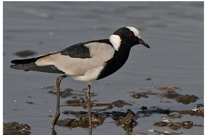
Blacksmith lapwings were common foraging for food along the water's edge

The first bird to attract my attention in the reserve was a blacksmith lapwing foraging along the edge of one of the dams. This was a familiar bird from my childhood in Johannesburg where I spent many happy watching them scampering around marshy areas. Its behaviour is pretty similar to our British lapwing we all know so well.