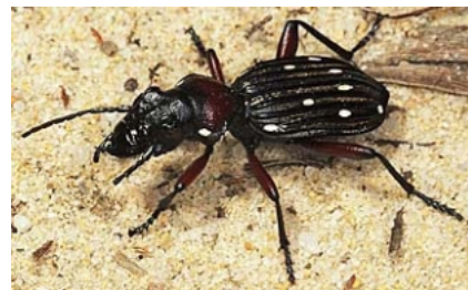
Ten-spotted ground beetle found running around the grounds of the lodge

fluid from the anus to disable their enemies. I once had a carabid beetle squirting a stream of acid across my face but fortunately, I had my glasses on. Where the fluid touched my face it burnt my skin – the red marks lasted for days. These defensive spray capabilities give rise to another common name for the group,