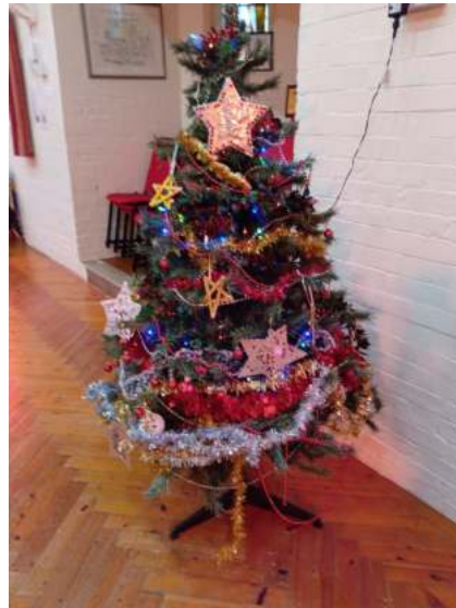
The Parish Hall is Ready for Christmas