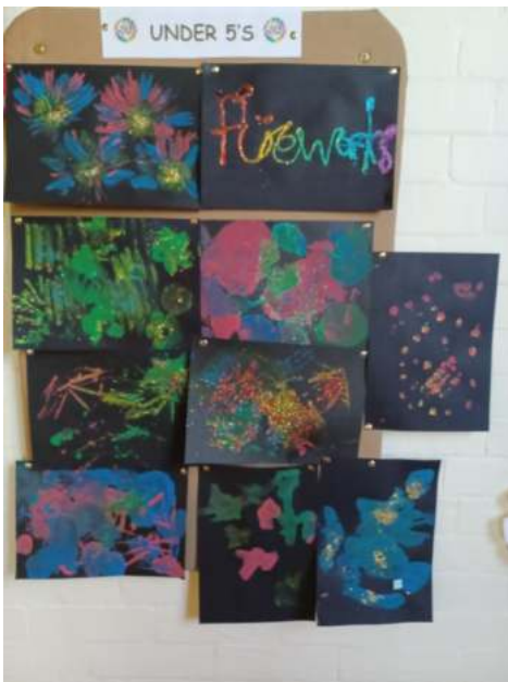
Remember, Remember the 5th of November