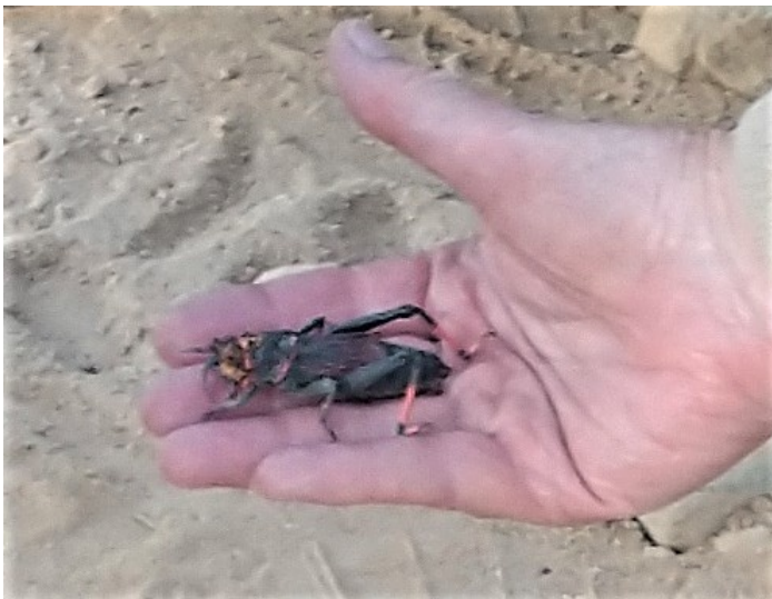
Holding the dead koppie foam grasshopper we found – colours faded because it was dead

Another interesting insect we found was a dead "koppie foam" grasshopper near the car park at the lodge at the game reserve. It was about 7-8 cm long and had striking black and red coloring that is a signal to warn other animals know it is poisonous. It is poisonous because it produces toxic foam from glands on its thorax if it is handled or attacked and that is why it is called the "foaming grasshopper".