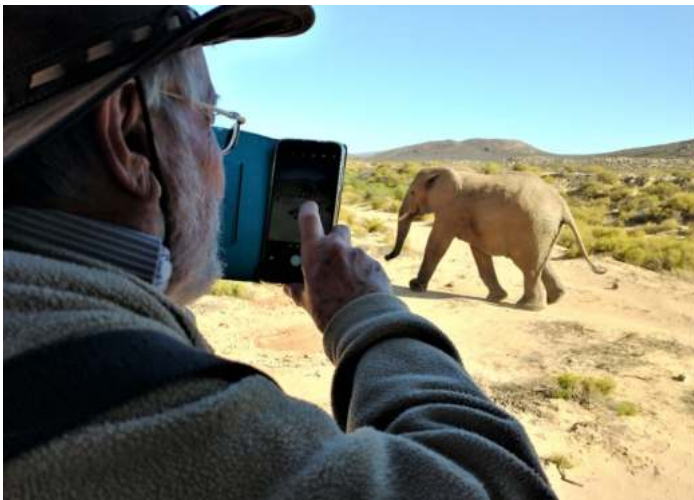
Photographing an elephant from one of the safari trucks

I spent most of my time in South Africa at Betty's Bay about 50 miles along the coast east of Cape Town in the heart of fynbos.