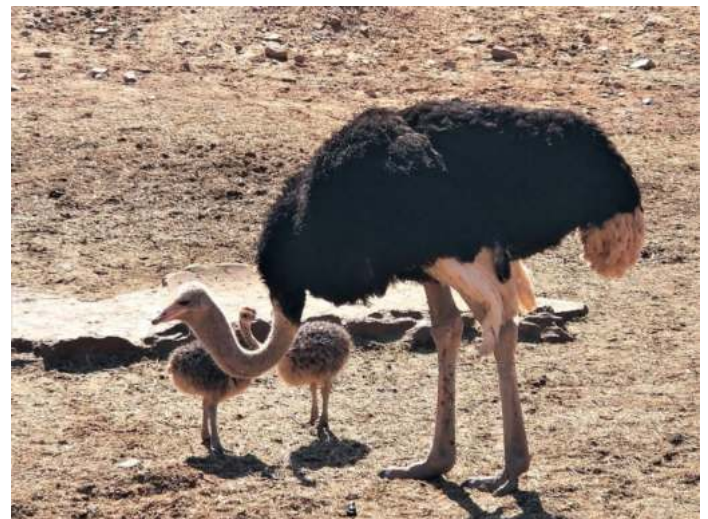
We photographed a male ostrich and its chicks in the game reserve

One bird that I saw that took me by surprise – the winchat - a familiar face from Wiltshire. They breed in the UK and Europe during the summer but in the cold northern winter migrate to the