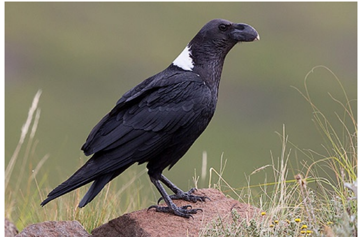
White necked ravens were common in the reserve

plumed male takes over and incubates at night.