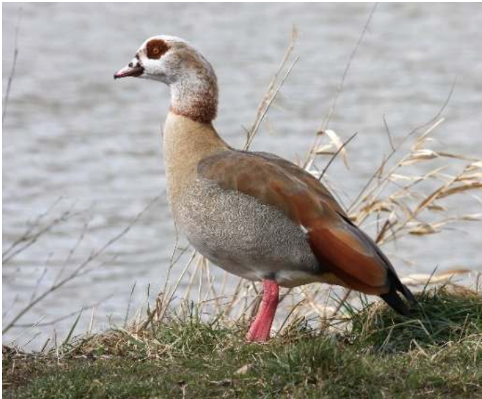
Egyptian geese were common on the dams

The main predaceous bird on the game reserve was the black eagle which I only saw in the distance on this trip. I know this eagle very well as we had a pair nesting on a cliff just a couple of miles from where we lived in Gauteng.