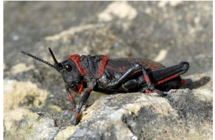
A living koppie foam grasshopper showing its true colours

fluid from the anus to disable their enemies. I once had a carabid beetle squirting a stream of acid across my face but fortunately, I had my glasses on. Where the fluid touched my face it burnt my skin – the red marks lasted for days. These defensive spray capabilities give rise to another common name for the group,