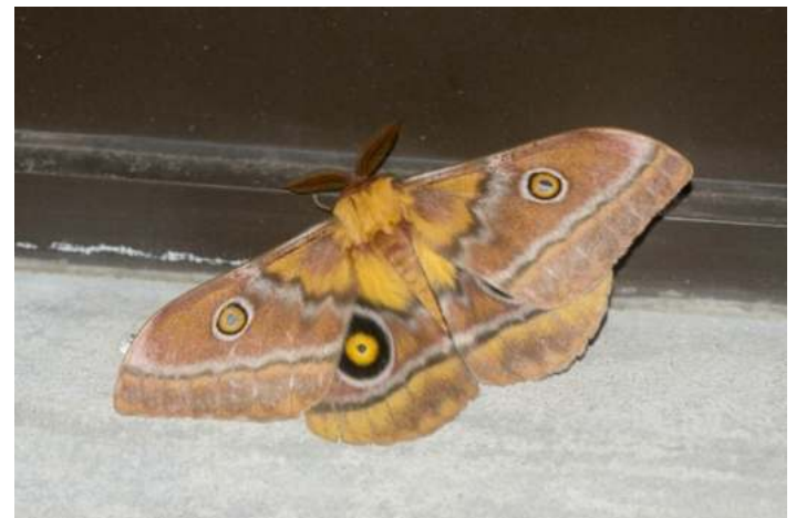
Pine emperor adult

In the next part of my trip, I visit Harold Porter National Botanic Gardens in Betty's Bay and have my own encounter with a troop of baboons.