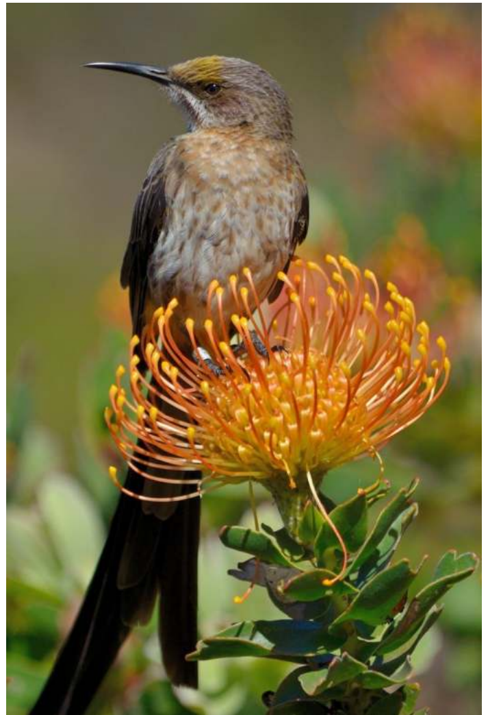
Cape sugarbirds were on virtually every orange pincushion protea