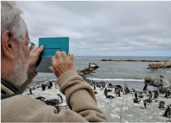
Photographing African or Jackass penguins on a slipway at Betty's Bay