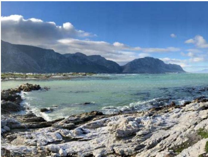
View of Betty's Bay with Kogelberg mountains in distance

After three days at the game reserve, we set off for Betty's Bay where my brother lived. Betty's Bay is a strip of land and houses between the Kogelberg mountains and the sea. The mountains are part of the 18 000ha Kogelberg Nature Reserve home of baboon, porcupines, klipspringer, grey rhebok, Cape genet, leopards, and many smaller mammals. At first glance it seems to be green & brown boring mountain nature reserve. Not at all - it has more plant species per hectare than anywhere else on earth.