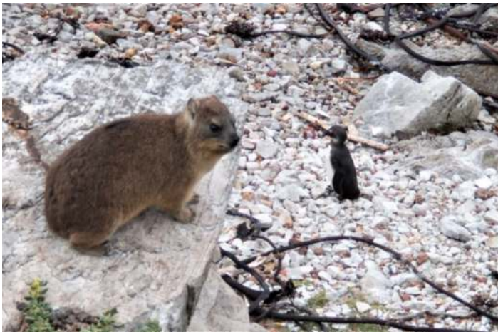
The rock hyraxes came right down on the beach with the nesting penguins