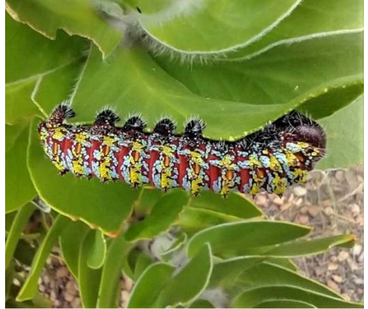
Pine emperor moth caterpillar

Later that day we visited my brother's large garden full of proteas and other fynbos plants. Here I found some large pine emperor moth ( Nudaurelia cytherea ) caterpillars about 11 cm long on one of his proteas.