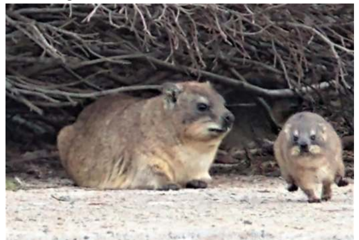
When we arrived, the first thing we saw were dassies (rock hyraxes) with lots of babies

It was so great to see the penguins doing so well. My brother pointed out that they had spread outside the reserve, and we could see other colonies further along the coast. At the reserve there were lots of large chicks moulting into adult plumage. There were also a few small chicks around. There were also lots of nesting cormorants and greater black-backed gulls. I was surprised to see some Egyptian geese swimming on the sea.