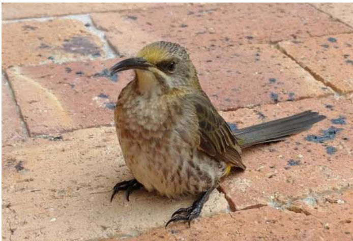
A female cape sugarbird flew into our window and stunned itself – it flew off after a couple of minutes

On our first morning in the house, we woke up to the sound of a Cape canary pecking on our tinted bedroom window. This is usually because they can see their own reflection, and think it is a challenger for their territory. The Cape canary is a common and gregarious seedeater in South Africa. Its call is tsit-it-it, and the song is warbled goldfinch-like trills and whistles given in display flight or from a high perch.