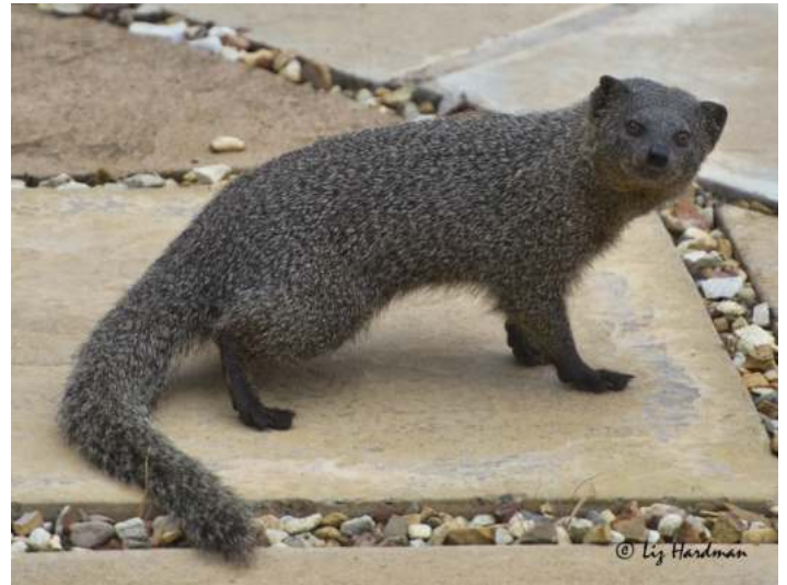
Outside on the patio was a Cape grey mongoose

After lunch we travelled to the penguin reserve at Stony Point about a mile away. When we arrived, the first thing we saw were dassies (rock hyraxes) with lots of babies. I am always amazed that their closest living relatives are elephants. My grandchildren absolutely loved them and the baby dassies were absolutely gorgeous. It was difficult getting the kids away from the dassies to go look at the jackass (or