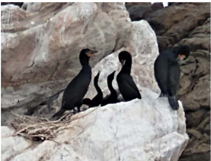
I also saw some Cape cormorant nests on the rocks above the penguin colony

Later that day we visited my brother's large garden full of proteas and other fynbos plants. Here I found some large pine emperor moth ( Nudaurelia cytherea ) caterpillars about 11 cm long on one of his proteas.