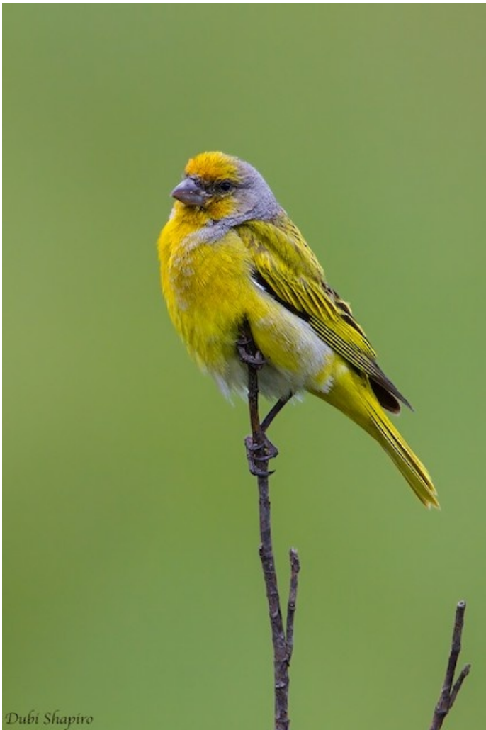
A Cape canary pecked at our bedroom window

eaten. Larger prey such as rodents are stalked and killed with a bite to the head. Large prey items are held down with the forefeet and then torn into bite size pieces with the teeth. They have been known to eat carrion and garbage as well. Often, they live in close association with man, often under the floors of outbuildings, and even live successfully on the fringe of suburbia.