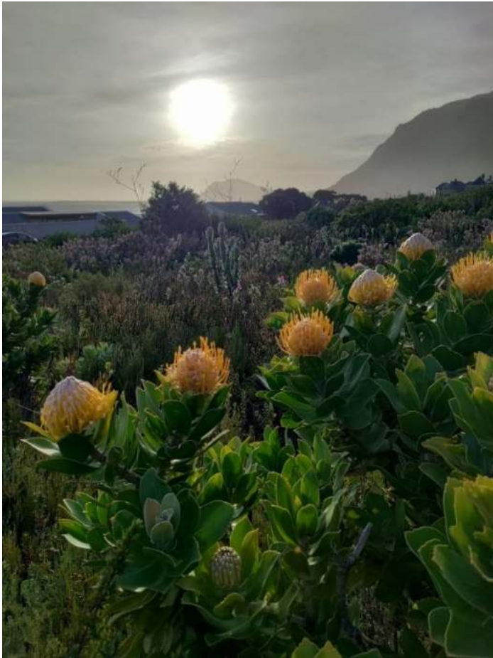
The pincushion proteas at Betty's Bay were absolutely stunning