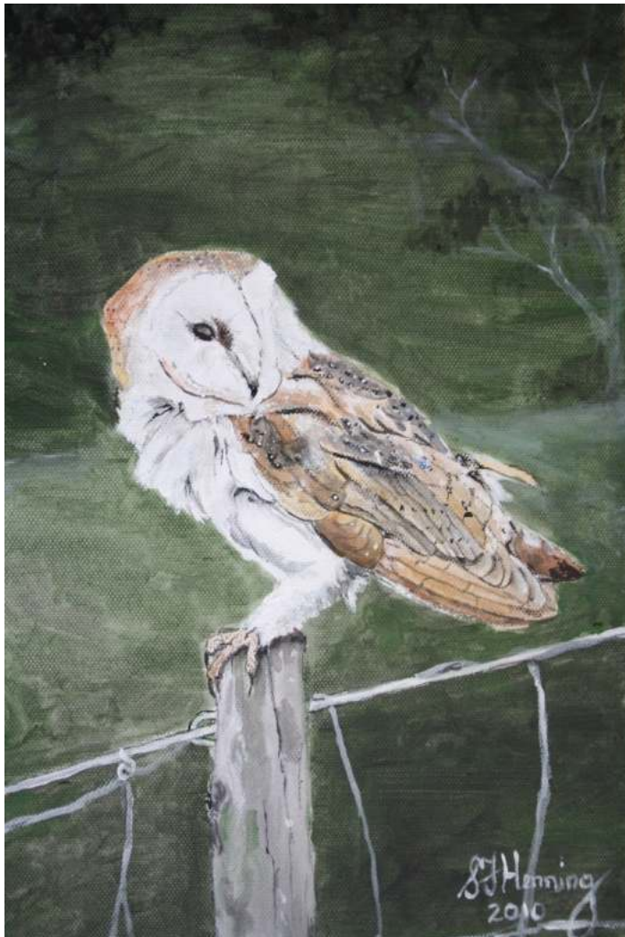
Barn owl perched on a fence post (del. S.F. Henning)

The barn owl usually hunts at night but occasionally comes out on dull days. At night they find their best food supplies along wood edges, where there is a high percentage of woodland rodents, and around barns and granaries, and other buildings that attract rats and mice. They eat huge quantities of small