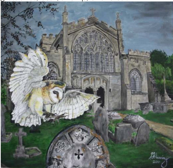
I saw a barn owl flying around the Edington Priory Church a few years ago (del. S.F. Henning)

I saw my first barn owl many years ago as a child in South Africa and did my first oil painting of one back in 1964. The barn owl is in fact a very widespread species being found in Europe, Africa, Arabia, India, and Asia southeast to Java. Over its wide range it's found in temperate, desert, and tropical regions and extends into grasslands, bush, swamp, and forest.