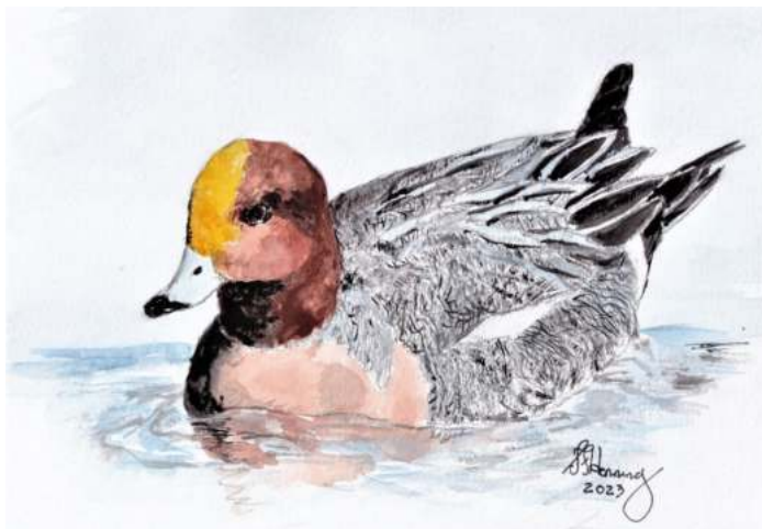
Male Eurasian Wigeon (del. S.F. Henning)

The Eurasian Wigeon is a winter visitor to Wiltshire, often forming large flocks on mudflats and inland wetlands. The male has a golden blaze on its forehead on a chestnut head and neck while the body is grey. The female is a rufous colour. It is usually found on inland wetlands, marshes, grasslands, and at the coast