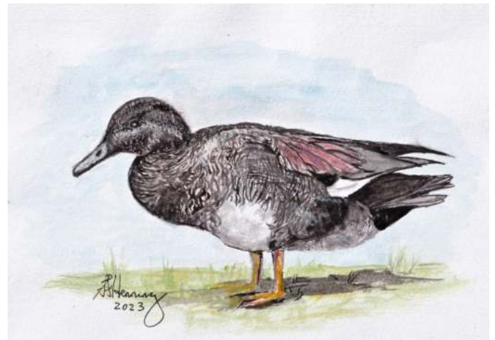
Male Gadwall (del. S.F. Henning)

The Gadwall is a rather nondescript grey and brown duck. It is mainly a winter visitor to Wiltshire but has bred here at times. It is usually found in freshwater marshes, lakes, reservoirs, and gravel pits. It feeds mainly on aquatic vegetation. Like the mallard, its nest is a lined hollow near water.