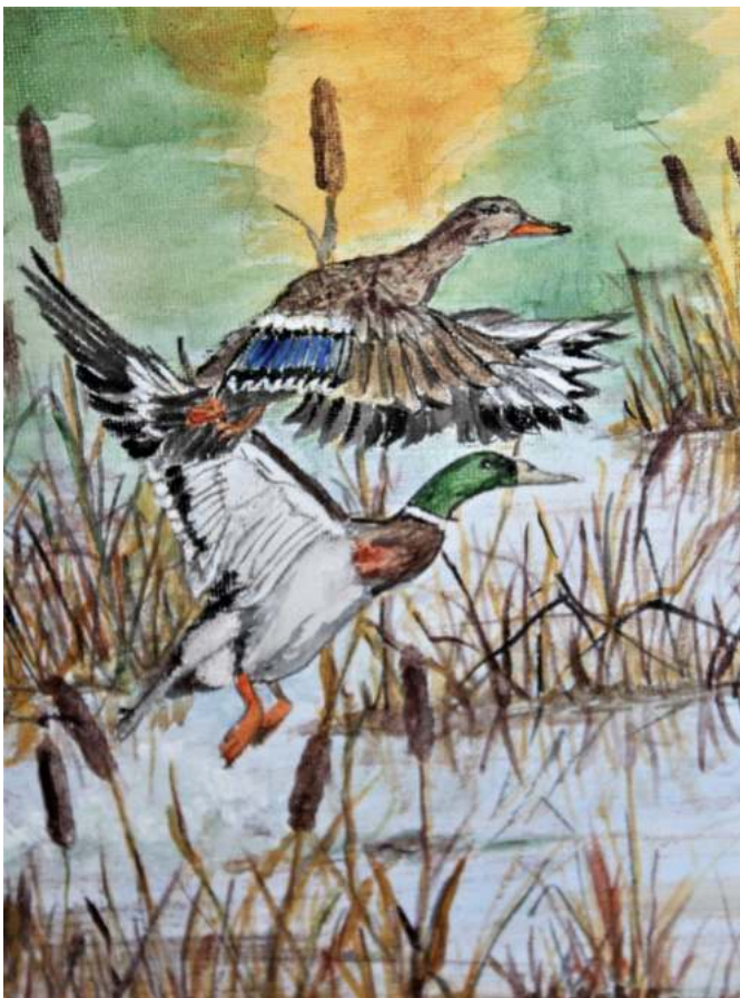
Mallards are strong fliers and often rise almost vertically from the water (del. S.F. Henning)

First of all, as we all know, ducks are web-footed for efficient swimming. They also have a large wide bill with a specialized tongue that allows water to be sucked in the front of the bill. An array of plates traps food particles as the water is expelled out the sides of the bill. Not all species feed this way, some graze on plants and some also catch fish.