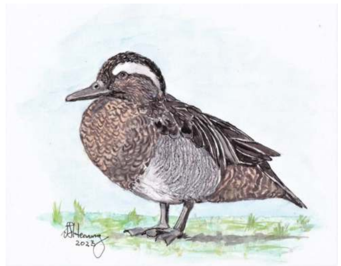
Male Garganey (del. S.F. Henning)

The Garganey is a scarce summer visitor to Wiltshire – it winters in Africa and is Britain's only summer migrant duck. It is to be found visiting open freshwater and marshes. It swims, and up-ends to feed on aquatic invertebrates and plants. It has been recorded in small numbers to breed in Britain in wetland habitats.