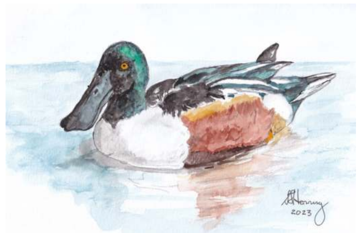
Male Northern Shoveler (del. S.F. Henning)

The Northern Shoveler is perhaps the most outwardly distinctive of the dabbling ducks thanks to its large spoon-shaped bill. In fact, no other duck has such a huge spatulate bill. It feeds with broad sweeps of its bill through shallow water and wet mud. Its uniquely shaped bill has comb-like projections along its edges, which filter out tiny crustaceans, mollusks, and seeds from the water. The male has a bottle green head, white breast, bright chestnut belly and a black back, while the female is much drabber, being mottled buff and brown. It breeds in Wiltshire on reed-fringed lakes and