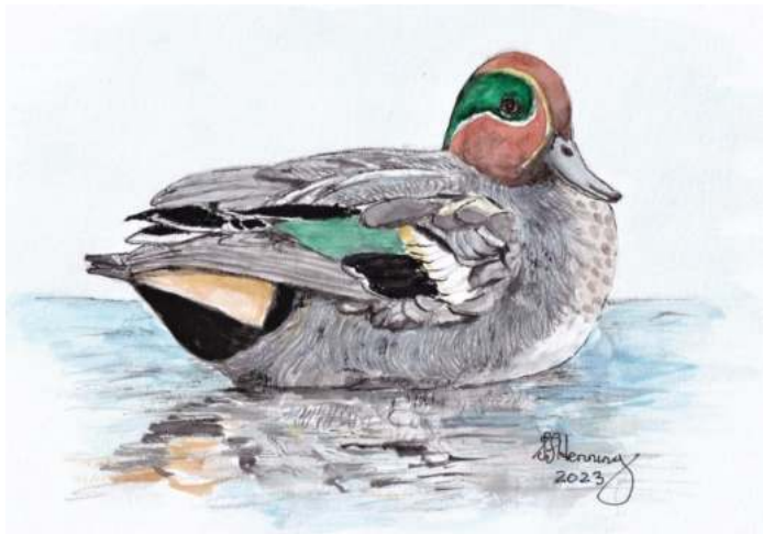
Male Common Teal (del. S.F. Henning)

The Common Teal is Britain's smallest duck. It is a fast flying and highly gregarious duck. It often forms compact flocks that fly in twisting, turning formation. It swims, wades, and walks and takes off and lands on the water or the ground. It feeds on aquatic vegetation and seeds. It breeds in Wiltshire and its nest is usually a lined hollow on the ground in a marsh.